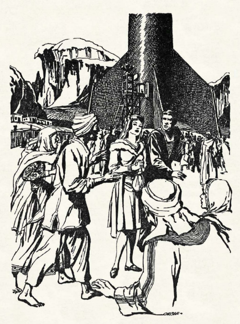
"Look, that's US there. They have stolen our bodies!"